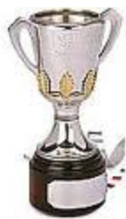
Under 16s Blue